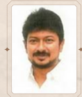
Thiru. Udhayanidhi Stalin Hon'ble Minister for Youth Welfare & Sports Development Department Government of Tamil Nadu