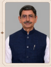
Hon'ble Shri. R.N.Ravi The Governor of Tamil Nadu