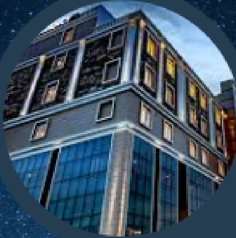
PP Residency 14km (20mins)

4km Away From Kelambakkam (Hindustan Institute Of Technology And Science)