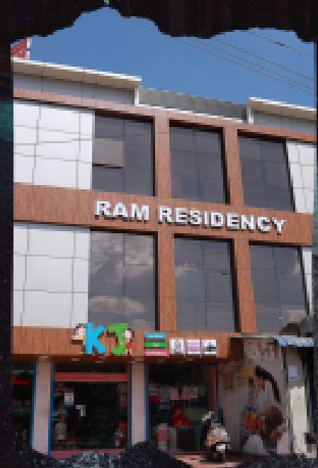
RAM RESIDENCY 15KM (21MINS) 4km Away From Vandalur Zoo (Towards Chengalpattu)

GUIDE POST FOR THE VISITORS WHO WISH TO STAY IN HOTELS ON THEIR OWN EXPENSE