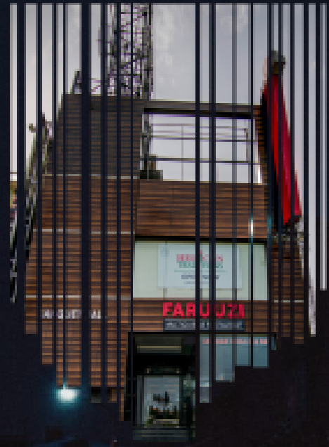
Flagship Jayam Residency 11km (16mins) 1km Away From Vandalur Zoo (Towards Chengalpattu)