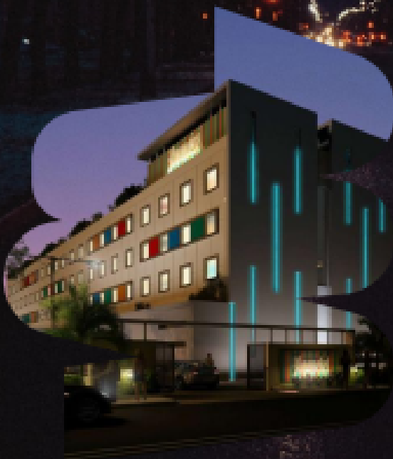
Kalyan Grand 10km (16mins) 0.5km Away From Vandalur Zoo (Towards Chengalpattu)